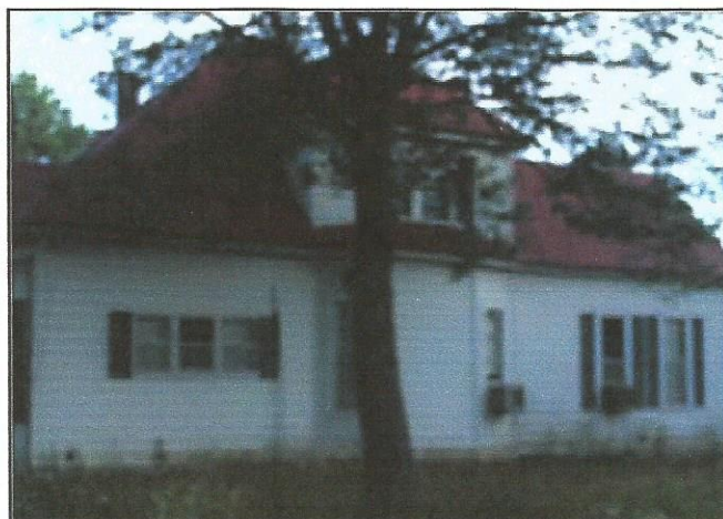
The above picture shows the back of the house on Curl Rd. Visitors and investigators feel like someone is watching them from the upstairs window.

When we arrived back at the house, we divided members into two teams. One team climbed the ladder